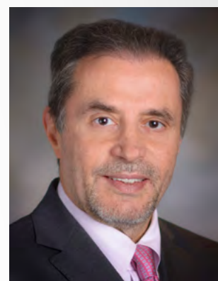
Prof. Hagop M. Kantarjian

Tel Aviv Sourasky Medical Center, Tel Aviv University, Israel